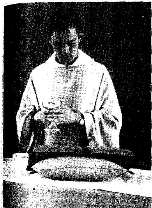
Blood poured out for us