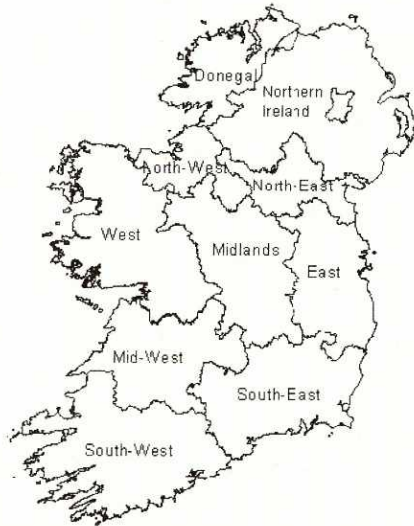
Physical Planning Regions, 1964