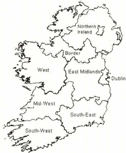
EU Regions, 1988