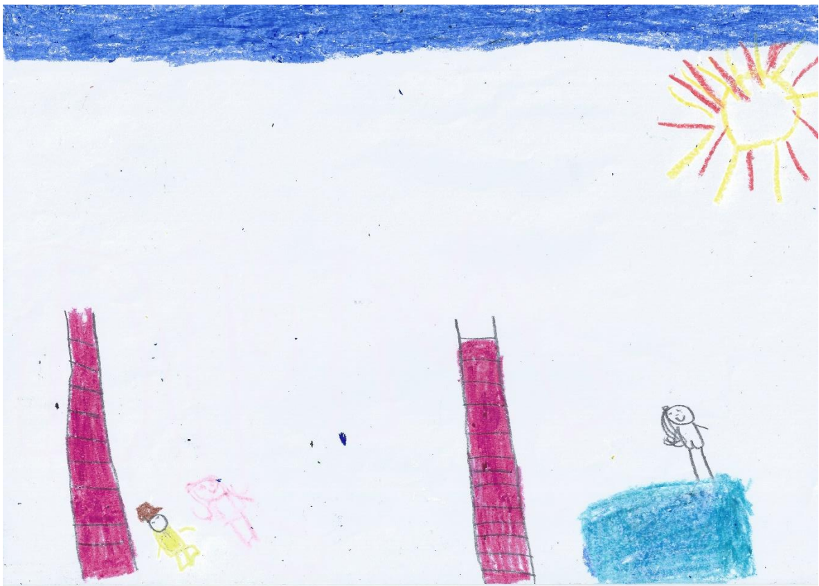
(FFG 2 Pupils Riverhedge 2A).