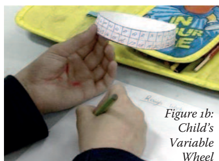
Figure 1b: Child's Variable Wheel

bers (1 – 26) on it (see figure 1a). The letter strip is wrapped around the number strip so that each letter aligns with a number. Start by having 'A' aligned with 1, 'B' aligned with 2, etc. (see figure 1a).